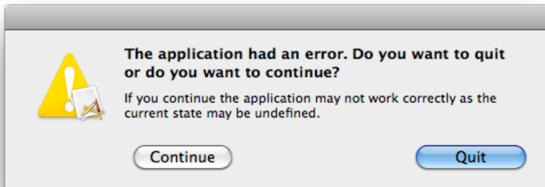
The question whether the application should continue.